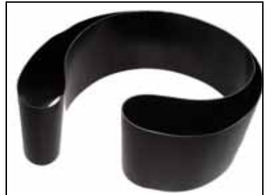
Epic Motor Drive Belts:

We invite you to run your own tests and discover the same! Contact your Epic representative today to place your order!